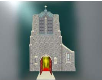
St. Paul's Episcopal Church

December 31st, 2008 was the day that 220 Valley Street the home of St. Paul's Church and the Covenant Soup Kitchen officially changed hands and the Soup Kitchen became the official owners of the property. It has